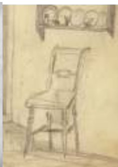
Wycombe scroll back windsor chair 1883