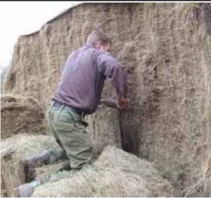
Conway hay Museum Update

During these difficult economic times, the main priority for the Museum must be fundraising and income generation. We are very grateful to all those individuals who so readily responded to our fundraising appeals, or give to the Museum enabling particular projects to come to fruition. Our need now is to work hard to increase our revenue and we welcome your help with marketing the Museum as widely as possible. But we also need assistance to broaden our income in other ways. If you have contacts with local businesses or filming companies for example, please help us to promote the Museum as a venue or film location.