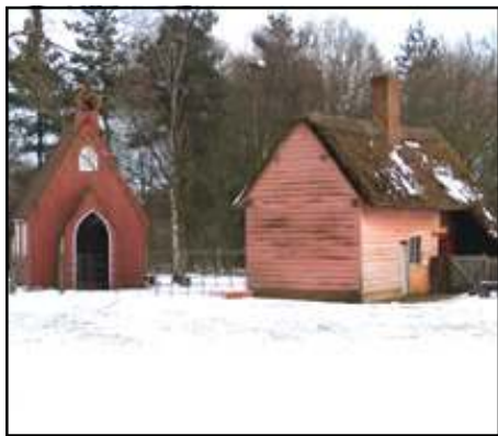
Museum Update The Museum in the Snow

Another project, Astleham Garden, is really taking shape now. With the support of H.G. Matthews Chiltern Pavers, staff and volunteers have laid paths based on "period" designs and it is hoped that the planting of the borders will take place just before the Museum opens to the public