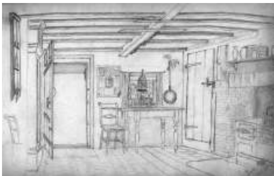
Interior of a Penn Cottage 1883

(Contribution provided by Cris Claxton Stevens, Museum Trustee)