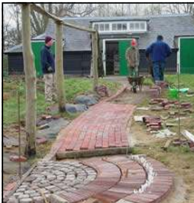
Spring 2009 Work progresses on Astleham Garden