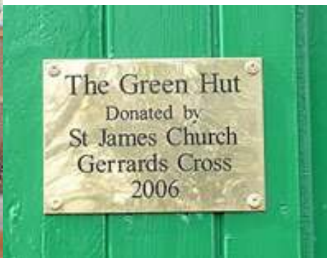
Gerrards Cross Artefact Store full of artefacts Museum Update