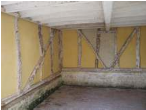
Museum Update Newly lime washed walls in Leagrave