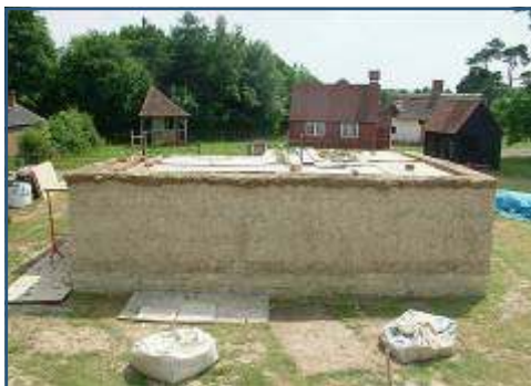
Work recommencing in June 2009