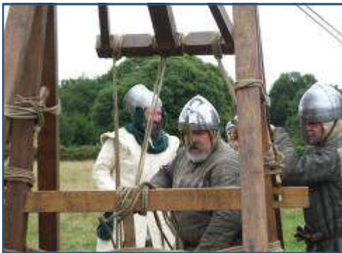
Meet the Norman Conquerors