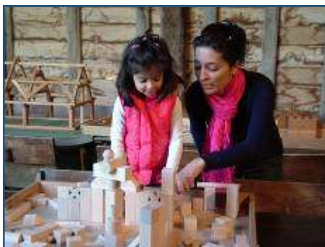
Building Blocks activities in Northolt Barn