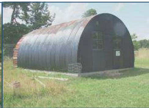
Sewell with the outer sheets fitted and tarring underway- 5 bays nearly completed