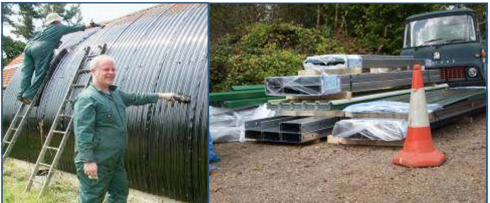
GE Money volunteers tarring Sewell

When the Shepherd’s hut was moved to the new lambing fold a modern wood burning stove was installed to keep Conway and his volunteers warm during