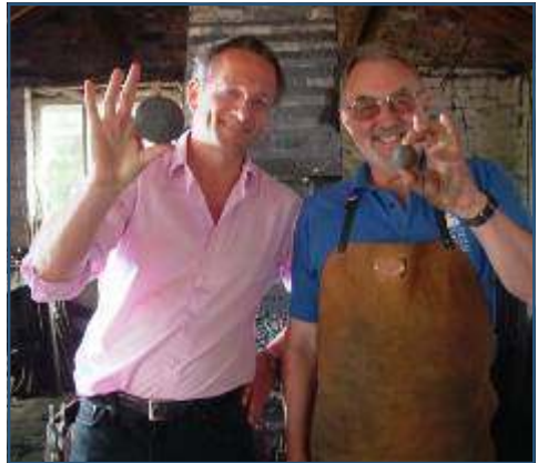
BBC Science documentary filming in the Forge