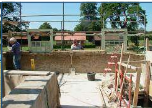
Scaffolding erected around the building and work continuing on the windows