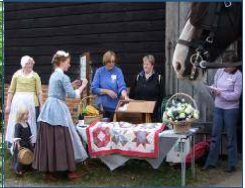
Friends Raffle Draw at the Harvest Event