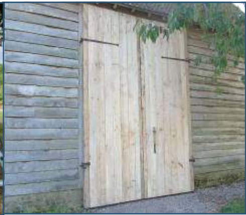
Doors closed for business!