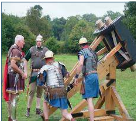
Romans preparing their siege engine at the August Bank Holiday event