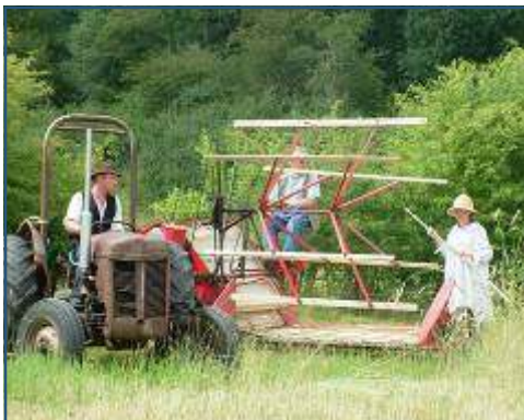
Harvesting the rye crop using the recently restored reaper binder