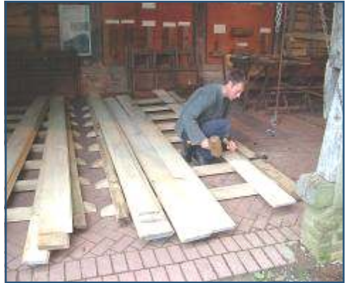
Joe Thompson fitting the boards to the Northolt barn doors