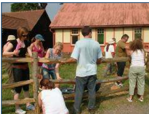
GE Money volunteers constructing traditional fencing by the mid-site loos