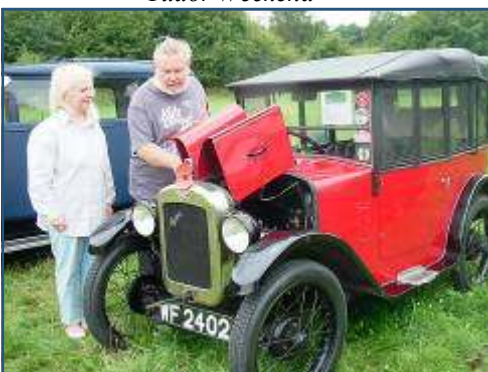
Classic Vehicle Show