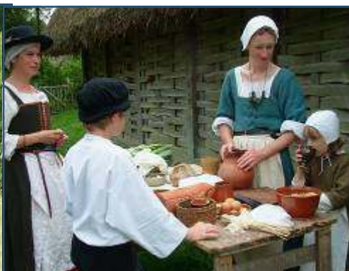
Tudor weekend with the Hungerford Household at Arborfield Barn