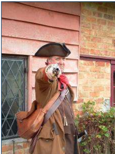
Classic Vehicle Show