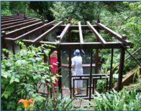
The Lyde Garden at Bledlow Ridge