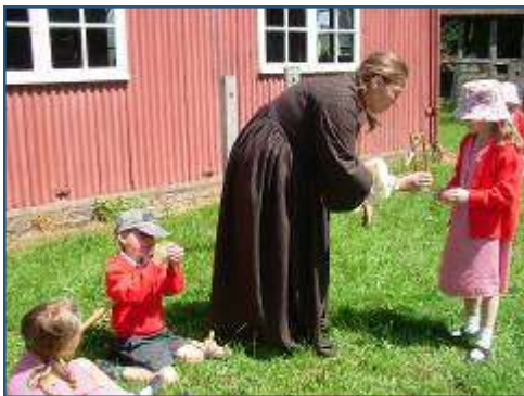
Toys and Games Special event

This year however we have been busy with lots of other parties as well as