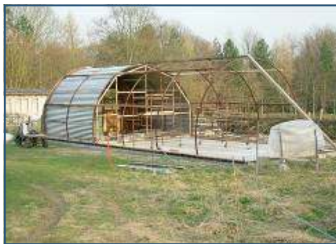
The replacement inner walls being fitted