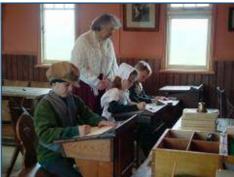
Victorian School Workshop