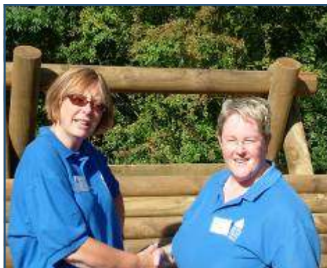
Chairman of the Friends and the Director admiring the playground repairs