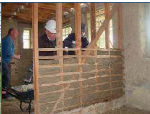
Filling in the gaps! Internal partition walls being filled in with wicket