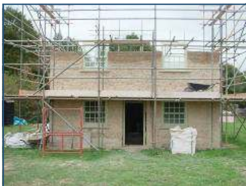
As far as we got this year!