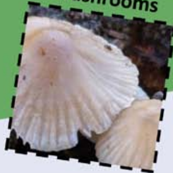
Two white/cream mushrooms