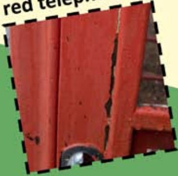
A red telephone box