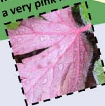
The underside of a very pink leaf